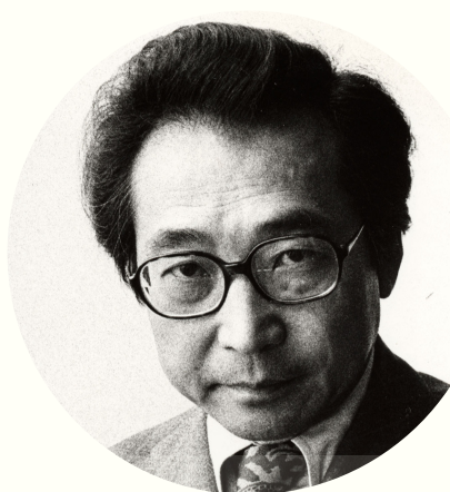
Chou Wen-Chung (1923-2019)