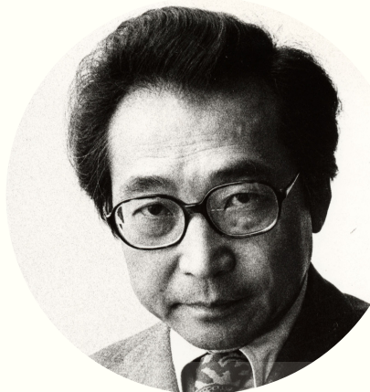
Chou Wen-Chung (1923-2019)