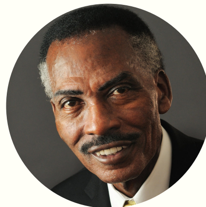
Olly Wilson (1937-2018)