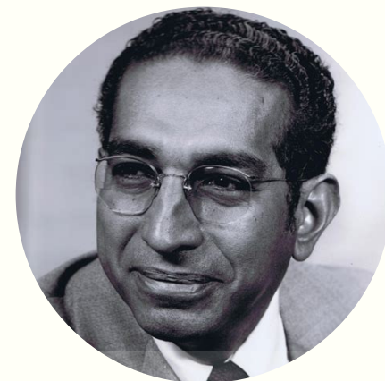
Roque Cordero (1917-2008)