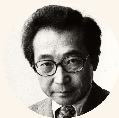
Chou Wen-Chung (1923-2019)