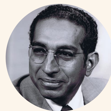
Roque Cordero (1917-2008)