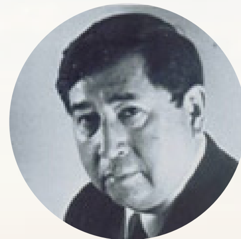
Louis Wayne Ballard (1931-2007)