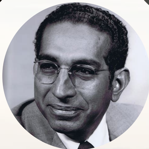
Roque Cordero (1917-2008)