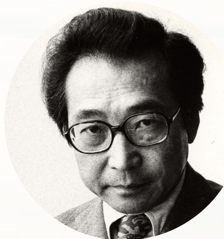
Chou Wen-Chung (1923-2019)

- you can read the latest posts by clicking on the names or photos of the composers below -